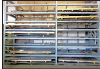
(1 OF 6) HD PLATE/SHEET STORAGE RACKS