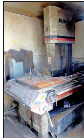
MARVEL SERIES 8 MARK II VERTICAL BANDSAW