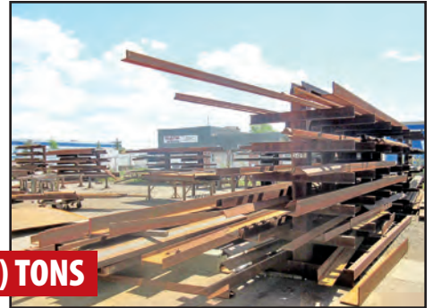
VIEW OF RAW MATERIAL