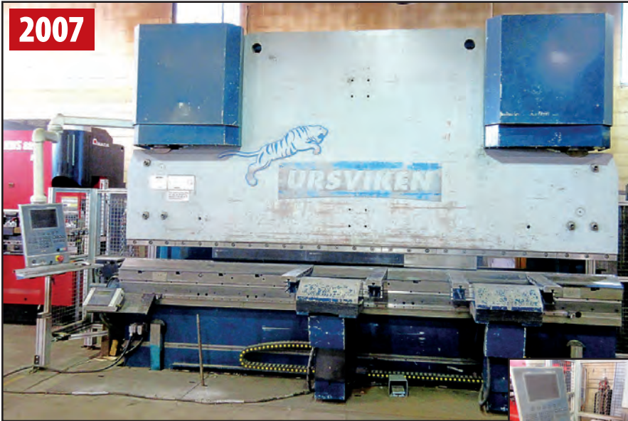
URSVIKEN OPTIMA 500 CNC PRESS BRAKE WITH URSVIKEN CNC CONTROL