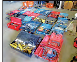
VIEW OF POWER TOOLS