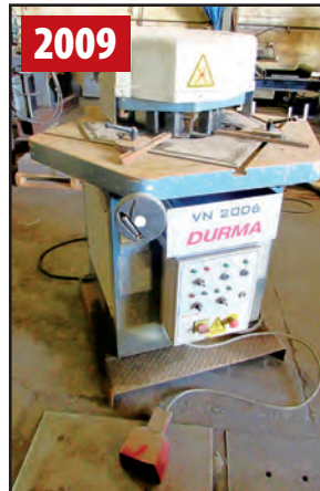
2009 DURMA VN2006 HYDRAULIC CORNER NOTCHER