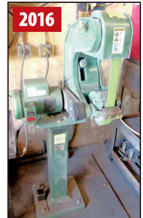
2016 BURR KING VERTICAL BELT GRINDER