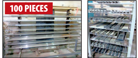
VIEW OF ASSORTED BRAKE DIES