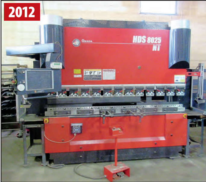
AMADA HDS-8025NT 80-TON X 102" CNC PRESS BRAKE