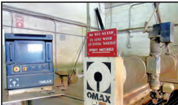
OMAX CUTTING HEAD AND CONTROL