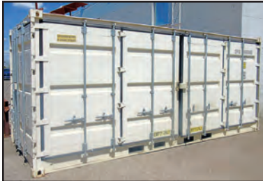
(1 OF 5) C-CANS

Online Bidding at www.perfectionindustrial.com