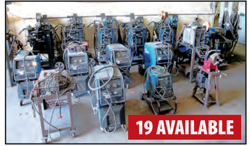
VIEW OF MIG, TIG AND ARC WELDERS