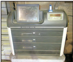
2014 MATRIX MINI AUTOMATED TOOL DISPENSER

SELECTION OF COMPUTERS, LAPTOPS, PRINTERS, PHOTOCOPIERS, BOARDROOM FURNITURE, EXECUTIVE OFFICE FURNITURE, MODULAR WORK STATIONS, RECEPTION FURNITURE, LUNCH ROOM EQUIPMENT, ETC.