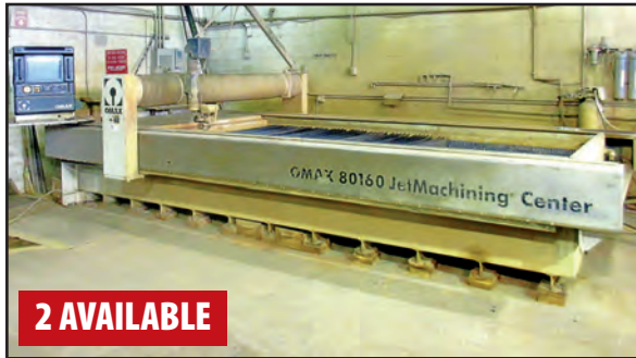
OMAX 80160 CNC WATERJET CUTTING SYSTEMS

HCT METAL MANUFACTURING, INC. D/B/A JP METAL MANUFACTURING