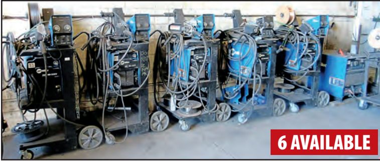
VIEW OF MILLER XMT 350 MIG WELDERS